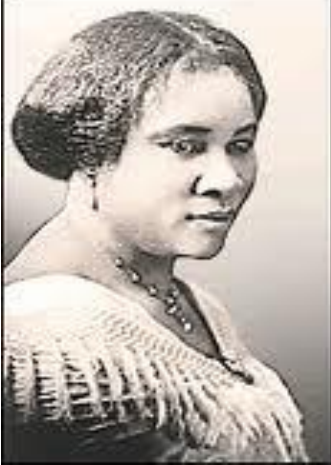
Madame C. J. Walker