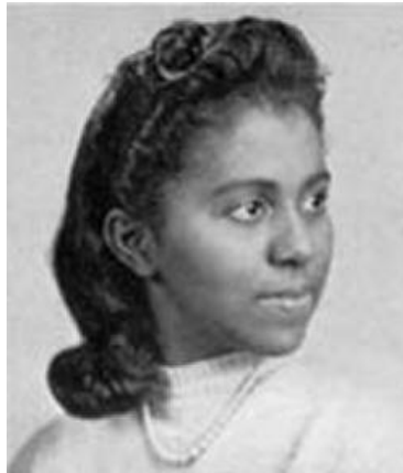
Dr. Marie Maynard Daly Clark