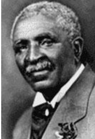
Dr. George Washington Carver