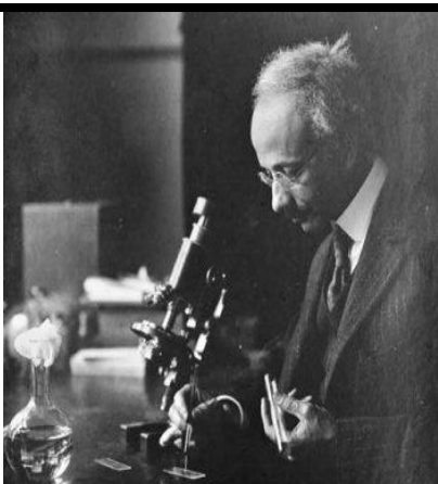
Dr. Solomon Carter Fuller